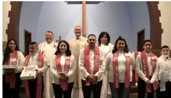
Confirmation and First Communion Service at Cristo Rey, Denver, Colo.